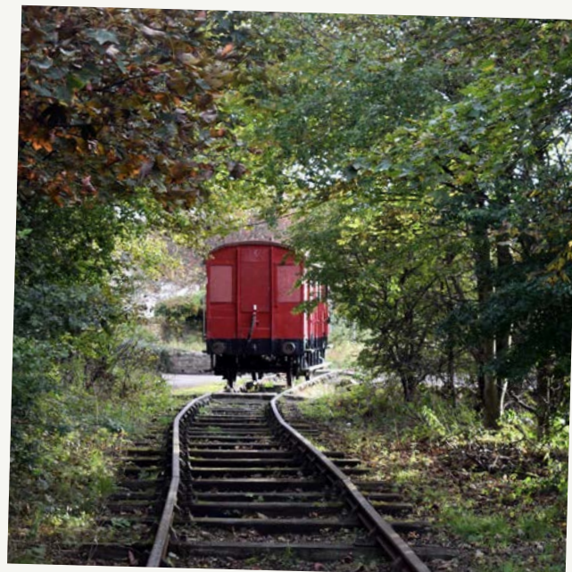
Prestongrange Industrial Museum