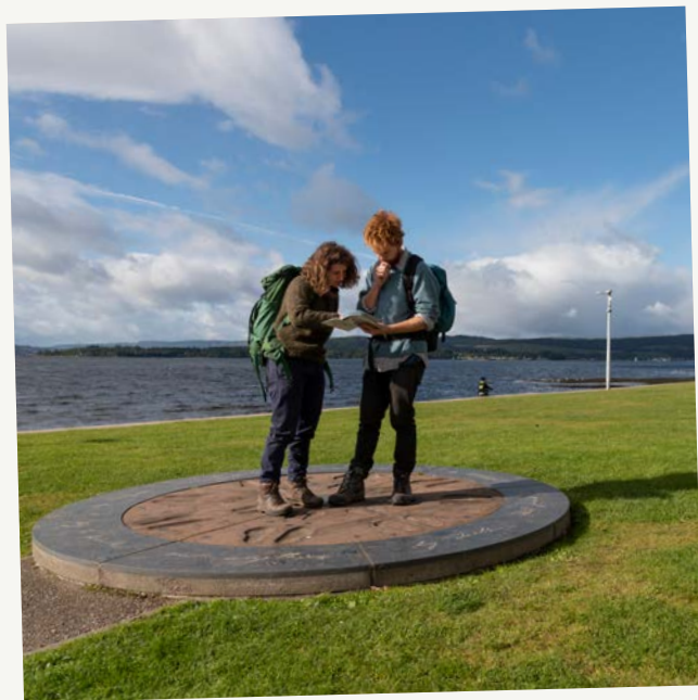
Route Start – Helensburgh Waterfront

Explore Charles Rennie Mackintosh's finest domestic creation, currently housed inside a protective 'box'. Go on a tour inside and out (even over the roof) and relax in the café.