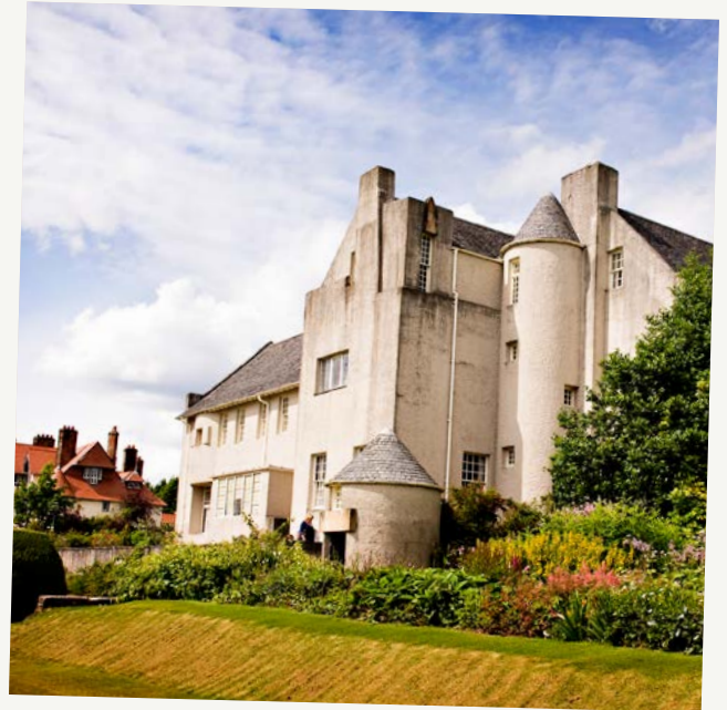
The Hill House