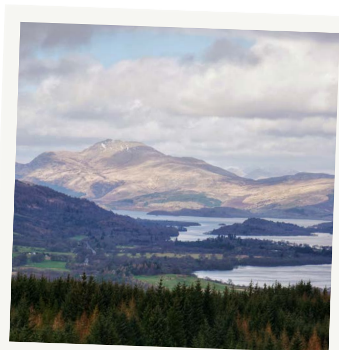
Ben Lomond from Gouk Hill