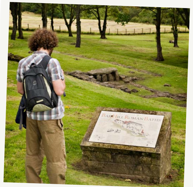
Bar Hill Roman Fort

A short but steep descent returns you to the Forth & Clyde Canal and back to Auchinstarry. This route is fully waymarked as the John Muir Way, following the cycle route along the canal and the walking route over the Antonine Wall.