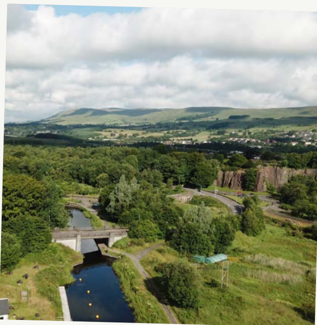
Forth & Clyde Canal