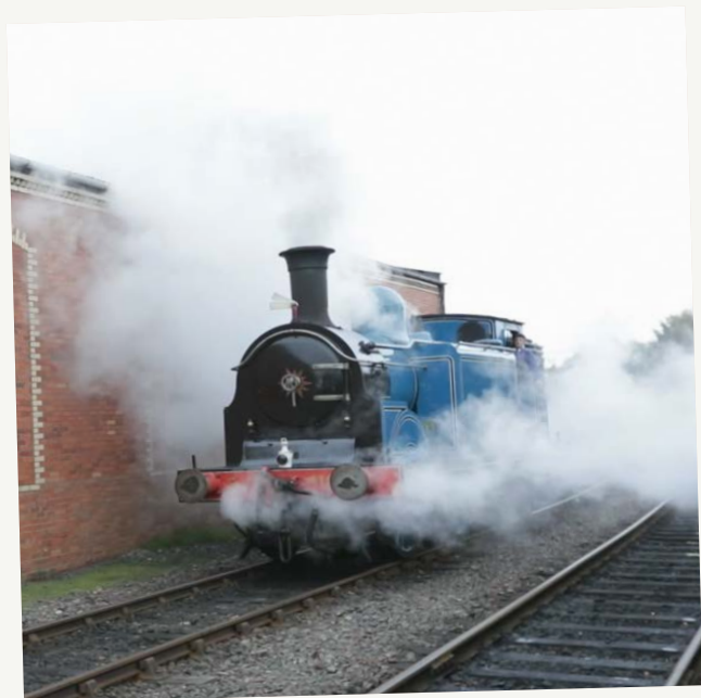
Bo'ness & Kinneil Railway