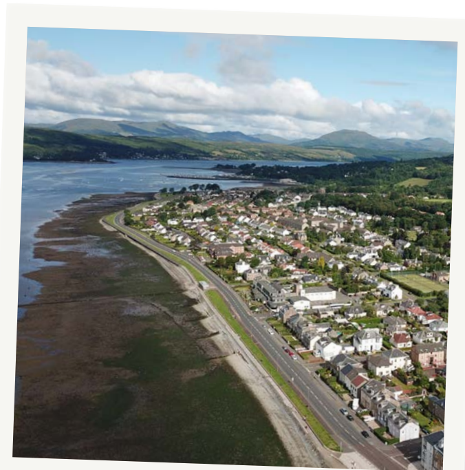
Helensburgh & Gare Loch

Enjoy the quiet single-track road along the glen before the steep climb and twisty descent towards the coast. Heading south along the A814 (there is a marked cycle lane) brings you back into Helensburgh with its choice of cafe stops.