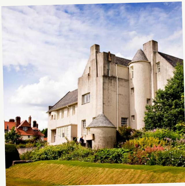
The Hill House

Explore Charles Rennie Mackintosh's finest domestic creation, currently housed inside a protective 'box'. Go on a tour inside and out (even over the roof) and relax in the café.